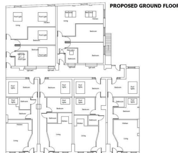
PROPOSED GROUND FLOOR