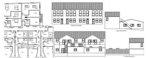
PROPOSED SCALE 1/100