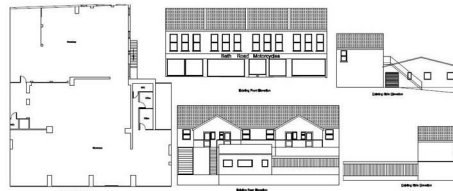
EXISTING SCALE 1/100